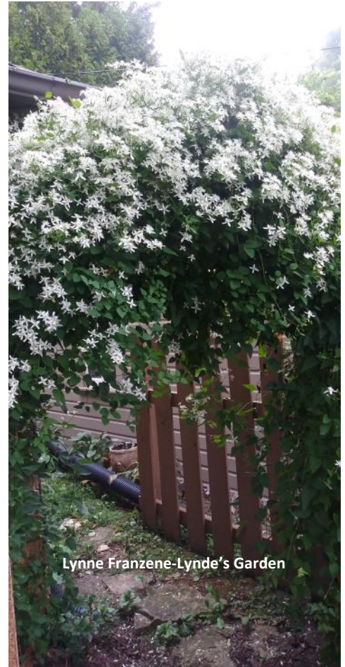
Lynne Franzene-Lynde's Garden