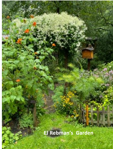
EJ Rebman's Garden