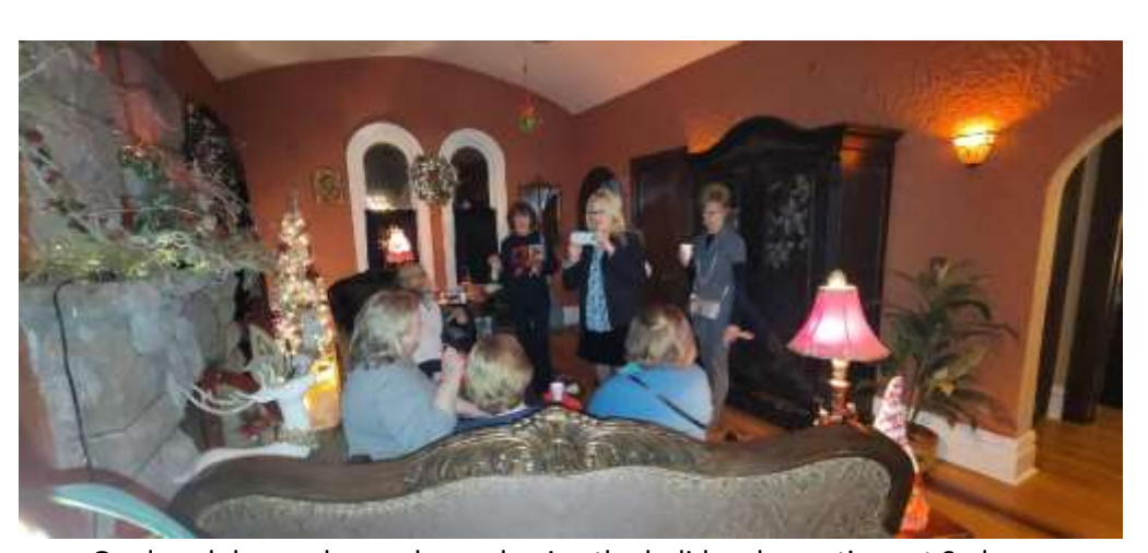
Garden club members relax and enjoy the holiday decorations at Sedona.