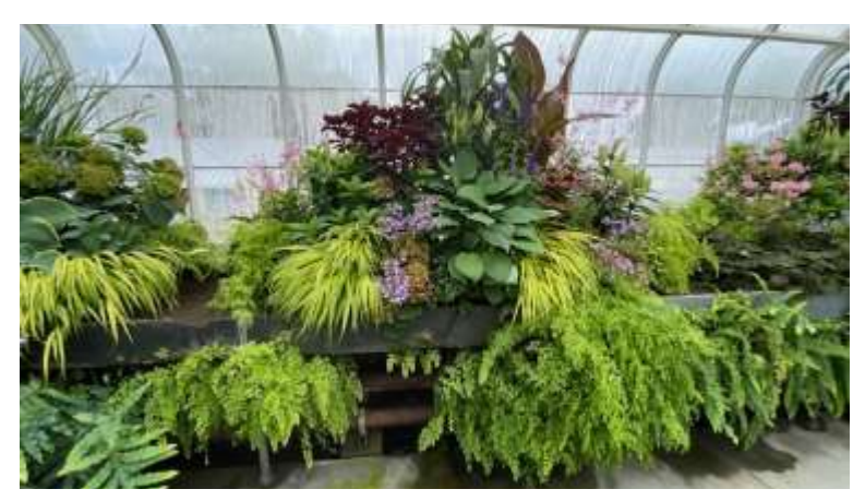
(Top) Jan Duncan's trip to see beautiful plants at Sea Parks Conservatory in Seattle, WA, June, 2023.