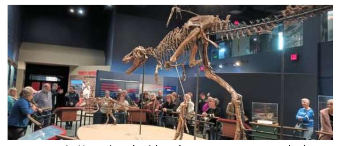
PLANTAHOLICS experienced a night at the Burpee Museum on March 5th.