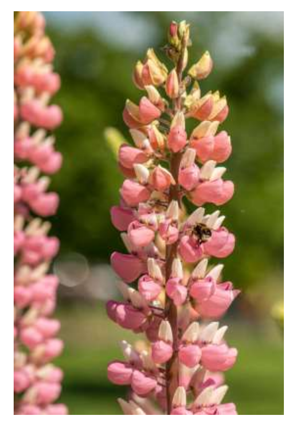
Beautiful spike-like raceme buds of the lupine.