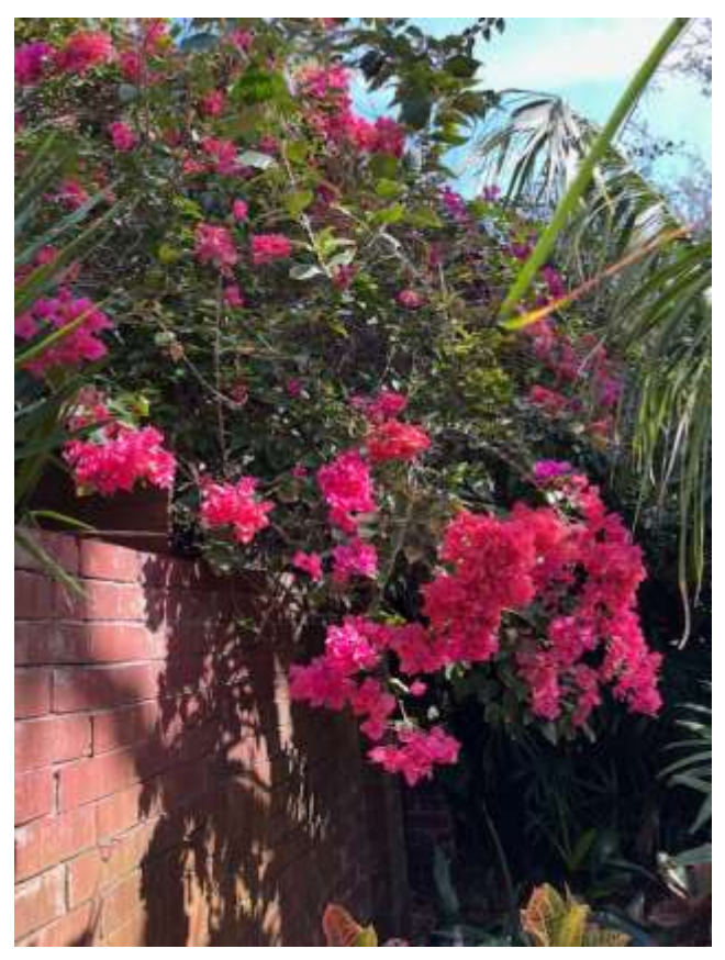
Bougainvillea at the Sunken Gardens in St. Petersburg, Florida in February, 2024.