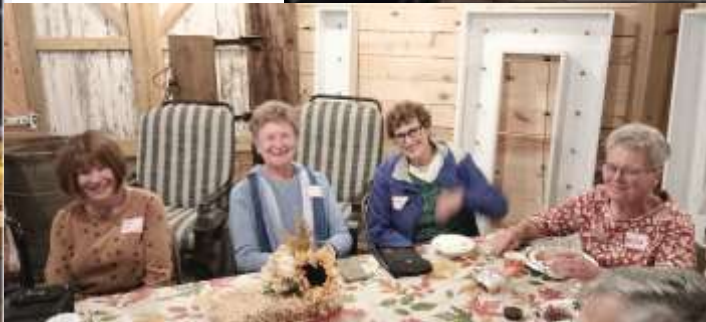
Fun, smiles, laughter, friendship, food and beverages. What a wonderful time when CRG members get together!