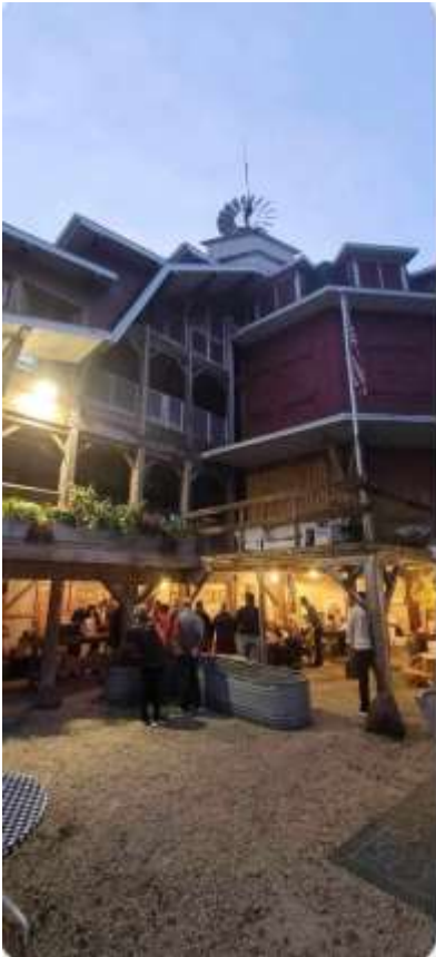
2024 CRG Fall Frolic